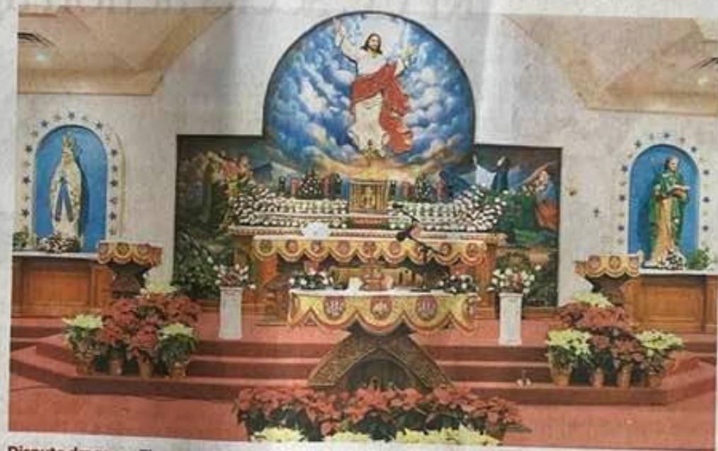
Dispute drags on: The crux of the controversy in the Syro-Malabar Church is whether the celebrant should face the congregation or the tabernacle during the holy Eucharist.

Quoting examples from other parts of the world, he