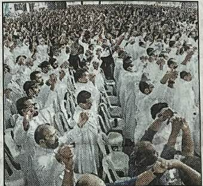
Priests at the public gathering in Kochi on Sunday