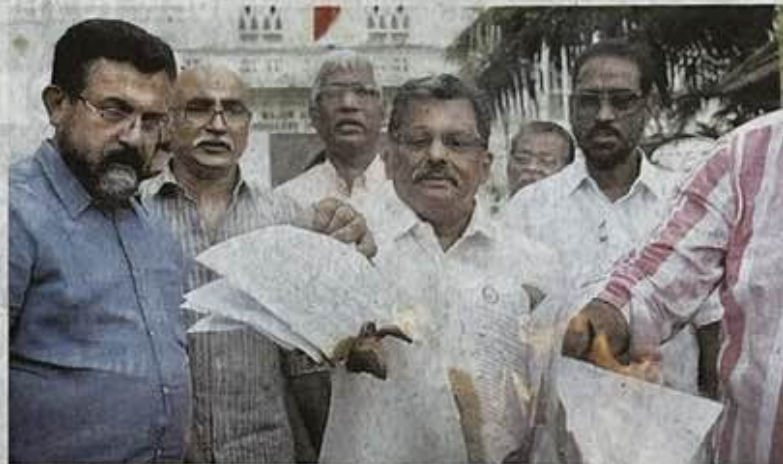
Members of the Almaya Munnettam burning a circular in front of Bishop's House in Kochi on Saturday.

priests and lay people, had said that representatives of parish councils would meet at the Pastoral Orientation Centre here on Sunday to discuss the developments. "It appears that our views have not been con-