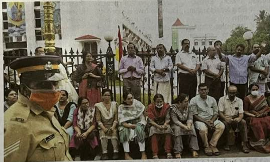
The faithful staging a protest against the implementation of the unified Mass system in the Ernakulam-Angamaly Archdiocese, at St. Mary's Cathedral Basilica in Kochi on Sunday.

Another group in favour of the unified Mass tried to