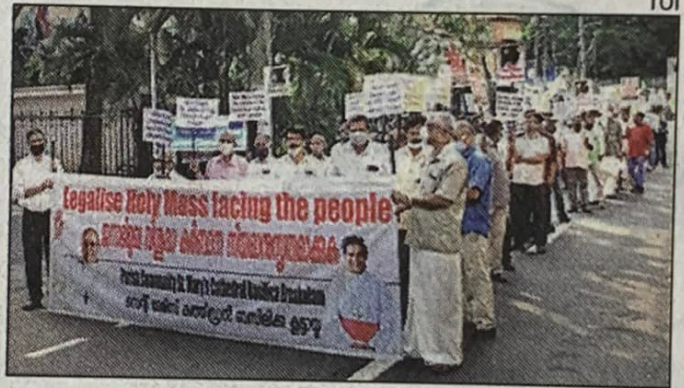
A procession was held to the bishop's house of the Ernakulam-Angamaly archdiocese on Sunday