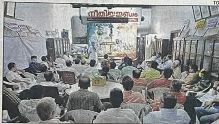
Priests and laity have been conducting an agitation, Neethi Yagnam, at Archbishop's house in Ernakulam opposing the bids to implement unified Holy Mass in the Ernakulam Angamaly archdiocese

alendar of the Syro Malabar Church set to begin on Sunday, priests of the Ernakulam Angamaly archdiocese had intensified the protests for regularising mass facing the people (Versus Populum) as the recognised form of Holy Mass in the archdiocese.