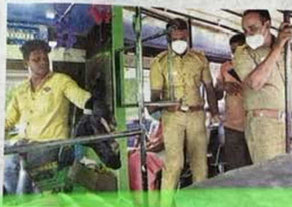
The Motor Vehicle Department officials inspecting vehicles on Wednesday to ensure there are no safety violations.

According to the police, it is the seventh case against online loan lenders registered at the Kochi cyber police station this year. However, no arrest could be made yet in any of the cases. "The operators use bogus mobile phone numbers and bank accounts. They are mostly based in North Indian states. These apps are not affiliated with any banks or operate as per the norms of the Reserve Bank of India. Their modus operandi is to give a small amount as a loan and reclaim more than double the amount lent by means of threat and harassment," a police official said.