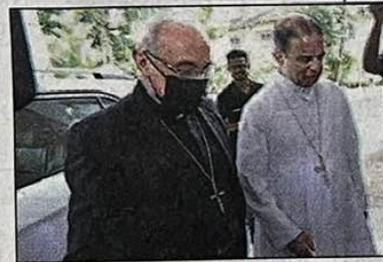
File photo Apostolic nuncio Leopoldo Girelli (L) with archbishop Antony Kariyil

car of Ernakulam-Angamaly archdiocese. The six-page letter was written under the letterhead of the archbishop with the designation, 'Vicar Emeritus of the Archeparchy of Ernakulam-Angamaly' and undersigned by Mar